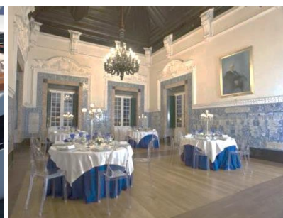
CRUZ VERMELHA PALACE