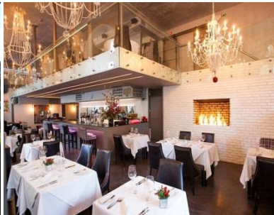
U CHIADO RESTAURANT