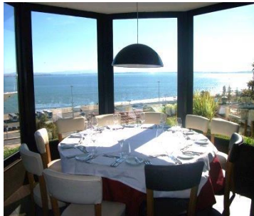
FAZ FIGURA RESTAURANT